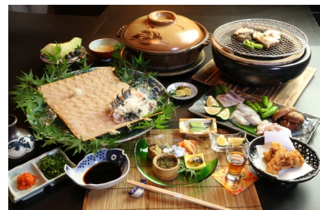
The popular full course changes in summer and winter.