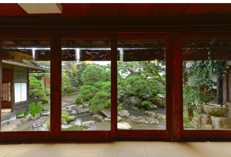
A former samurai residence turned into a traditional Japanese inn & restaurant. The building and garden are quaint.

Since this place is also an inn, she spends a lot of time interacting with customers. She says it's also her role to connect the region and customers by conveying information about tourist attractions and the town. The famous pufferfish cuisine is of course popular, but the quaint buildings and gardens are also popular with overseas customers. "According to the season and purpose, I arrange flowers and hanging scrolls for visitors." She said with a smile that she has never learned flower arrangement herself, but is imitating her mother-in-law. She looked up at the sky as if pondering the flowers and scrolls of the day. It was another day of nice weather in the town again.