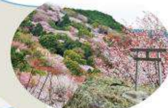
An hour walk starting from the Tourist Information

At the foot of Chinnanzan Mountain, Ooiwa can be seen from the city. When the cherry blossom blooms its mountain side cherry trees turn the whole area pink. With stunning views of the city and the Bungo Channel it is a perfect spot for a short hike and a bit of scenic sightseeing.