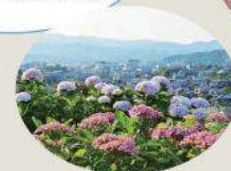
A half hour walk starting from the Tourist Information

Located at Myokenji (temple), this garden features around 2,000 hydrangea plants of 200 different varieties. While it's popular locally, it's still a hidden gem for overseas visitors to discover. Capture a rare heart-shaped hydrangea on camera and who knows? love might blossom too!